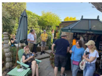
Crowding in the shade