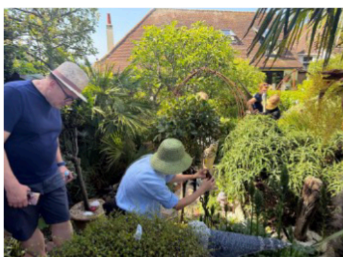
Visitors loving the detail