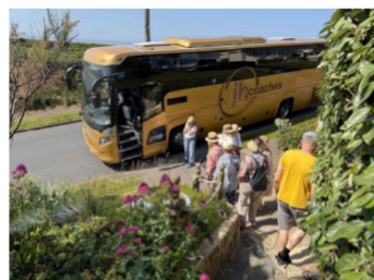
On to the next garden