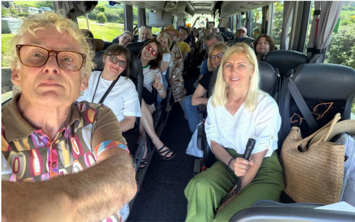
Delivering the talk on the coach.