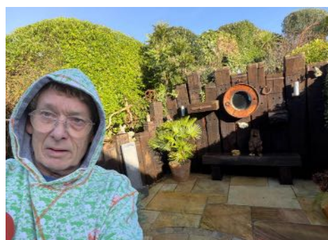
Competed power clean at the back