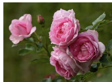
Mum in a Million