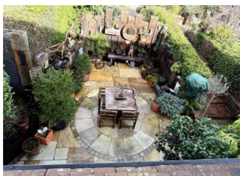
Rear patio clean

Read more of Geoff's garden at www.driftwoodbysea.co.uk or follow both him and the garden on social media.