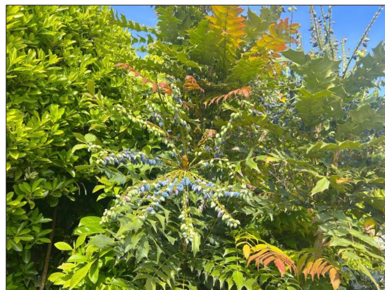
Mahonia winter sun