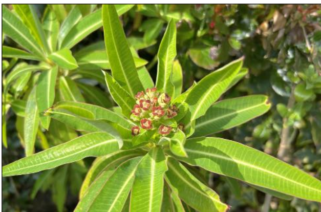
Euphorbia mellifera has become a popular garden plant