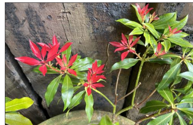
New leaves appear bright red in spring for Pieris 'forest flame'