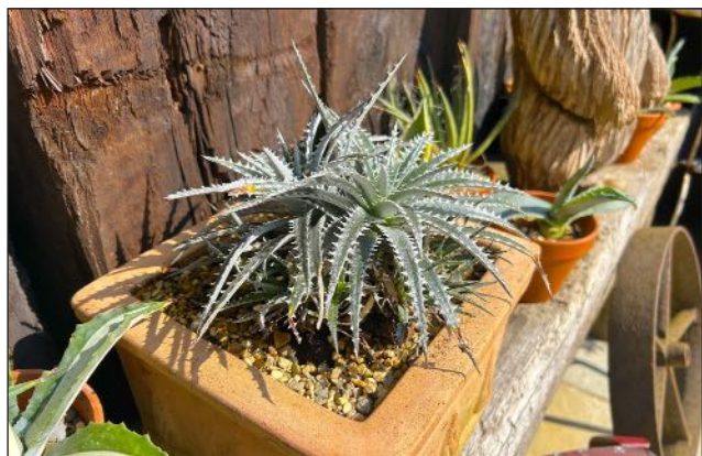
Dyckia 'brittle star' is a bromeliad native to South America