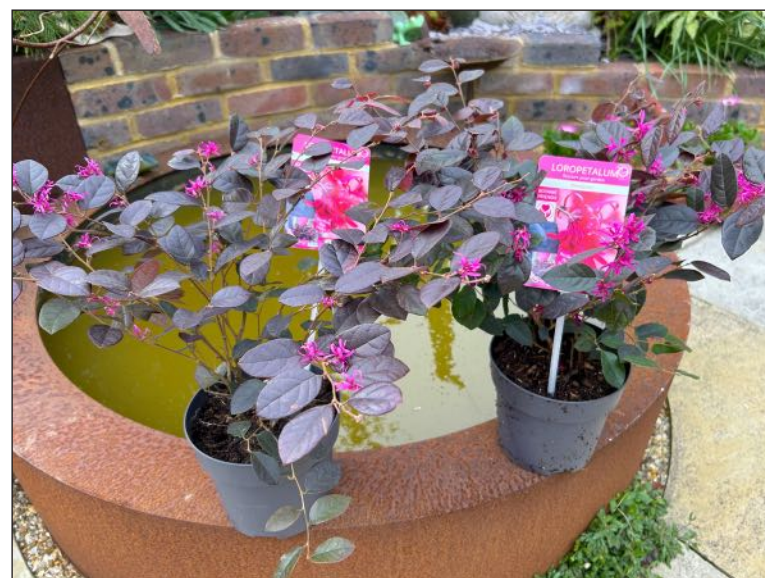
Loropetalum chinense 'fire dance' deserves to be better known

■ Read more of Geoff's garden at www.driftwoodbysea.co.uk