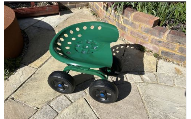
A garden aid