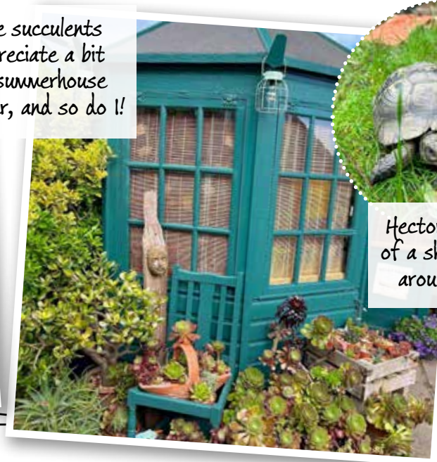
Hector is a bit of a shell-ebrit around here