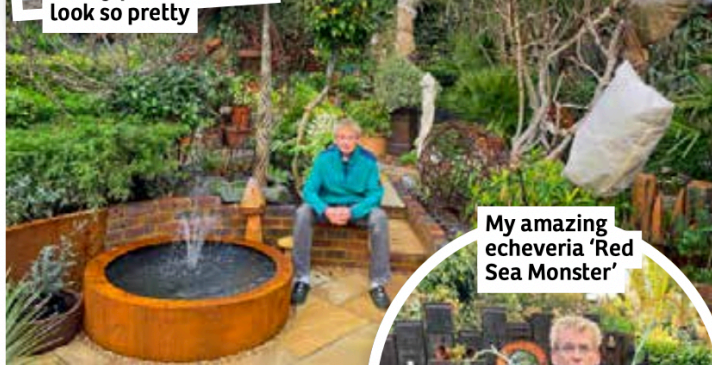
The new corten pond and fountain