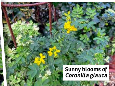
Sunny blooms of Coronilla glauca