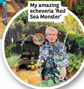
My amazing echeveria 'Red Sea Monster'

a cushion for it to use as seat or simply use it as a display bench for succulents. Time will tell!