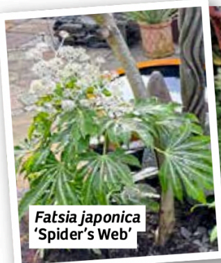
Fatsia japonica 'Spider's Web'

● Read more of Geoff's garden at www.driftwoodbysea.co.uk .