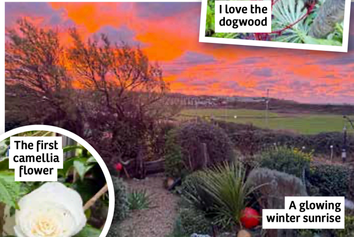
A glowing winter sunrise

A cobweb had appeared across the corner of the old railway sleepers and it acted as a net for the falling petals. Beautiful.