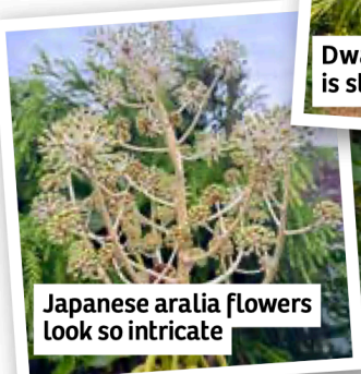
Japanese aralia flowers look so intricate