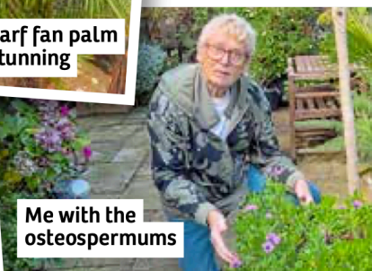
Me with the osteospermums