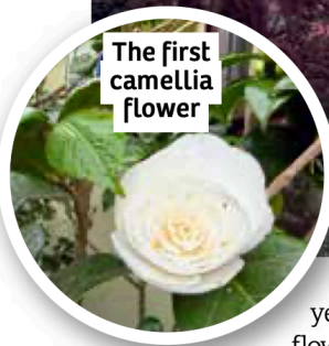
The first camellia flower

In the run-up to Christmas there were some pretty stunning early morning sunsets to be seen as a backdrop to the beach garden, where some wonderful colour prevailed all winter, from plants like the Helleborus argutifolius , and the Coronilla glauca , whose dazzling