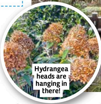
Hydrangea heads are hanging in there!

Last month saw the annual garden maintenance of the house and garden boundaries completed by a local landscaper on an extremely cold day. Among the varied tasks, they removed a sea buckthorn tree which had started to fail last year and become an eyesore. The area looks much more open now without it, especially with the ivy and next door's bay trees well