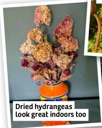
Dried hydrangeas look great indoors too

A more tidy space now the sea buckthorn has gone