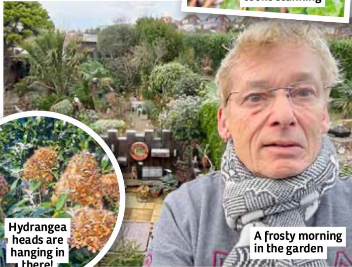
A frosty morning in the garden

A seaside garden in East Sussex that opens for charity, featuring sculpture and reclaimed objects.