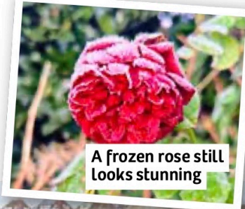
A frozen rose still looks stunning