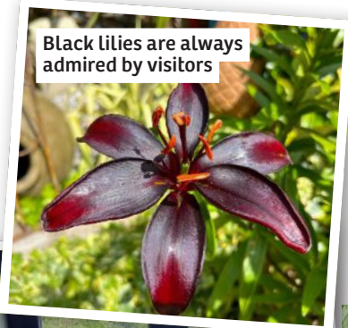
Black lilies are always admired by visitors

Read more of Geoff's garden at www.driftwoodbysea.co.uk or book a visit before July 31 by emailing driftwood@gmail.com