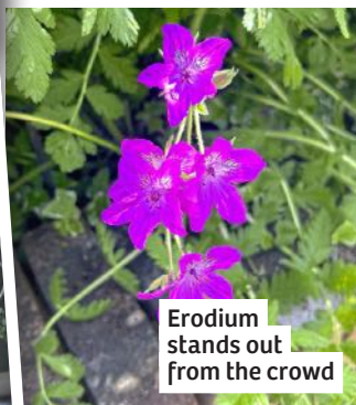
Erodium stands out from the crowd