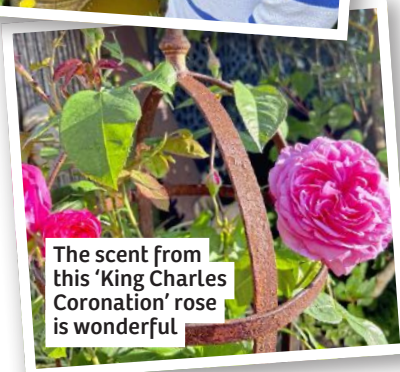
The scent from this 'King Charles Coronation' rose is wonderful

As well as being easy-to-look-after indoor plants, succulents are an amazing addition to any outdoor garden room. Their only drawback is having to be kept frost free over the winter. Most succulents are slow growing and love light. Though most varieties won't survive with full shade, they also don't need to be blasted with hot rays all day. The new railway sleeper area I created a couple of years ago is the perfect backdrop for much of my collection.