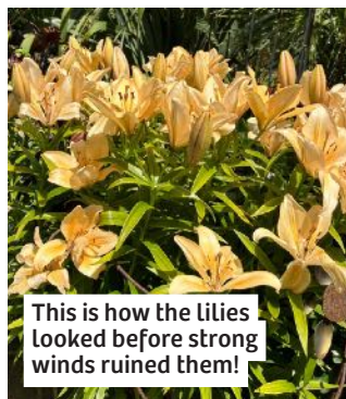
This is how the lilies looked before strong winds ruined them!

My highlight Succulents showing off all through the garden.