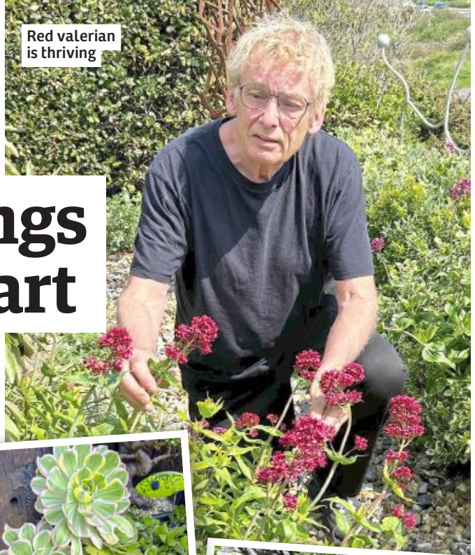
Red valerian is thriving

I've had many positive comments about the large number of succulents displayed across the garden.