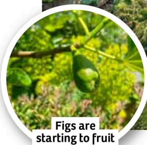
Figs are starting to fruit

more naturalistic, shall I say, especially in the beach garden. That said, I'm confident visitors won't notice too much. The hellebores at the front have all looked spectacular this year, especially those grouped around the old rowing boat, and the two large clumps of blue iris are spectacular.