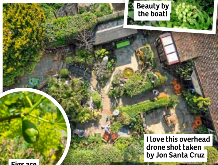
Beauty by the boat!

I decided to delay the garden opening until now to ease the burden a little. This year I haven't been able to place too much attention on the detail and cutting back, so it's looking a lot