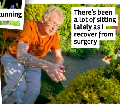
There's been a lot of sitting lately as I recover from surgery