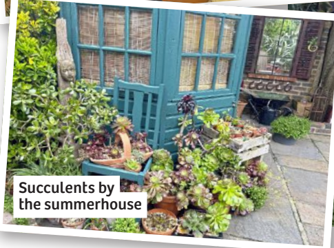
Succulents by the summerhouse