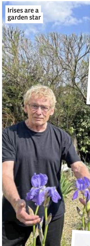
Irises are a garden star

badly burnt by wind through the winter and I had to remove some damaged fronds. The latter are producing some fabulous