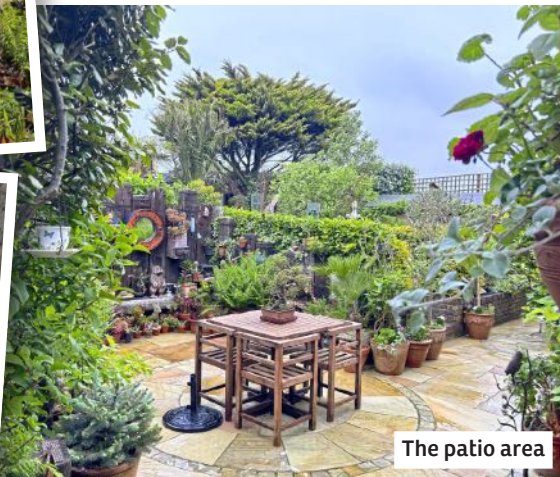
The patio area

My highlight Beautiful rises in the beach garden.