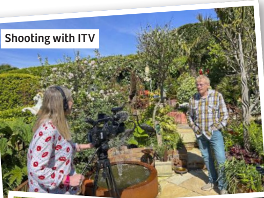
Shooting with ITV

Read more of Geoff's garden at driftwoodbysea.co.uk . Local to Sussex or planning to holiday here before July 31? Why not come see the garden and say hello?