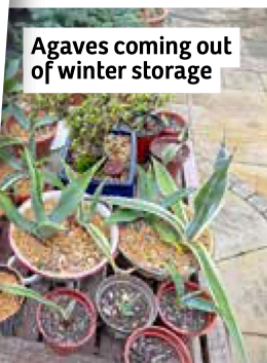
Agaves coming out of winter storage