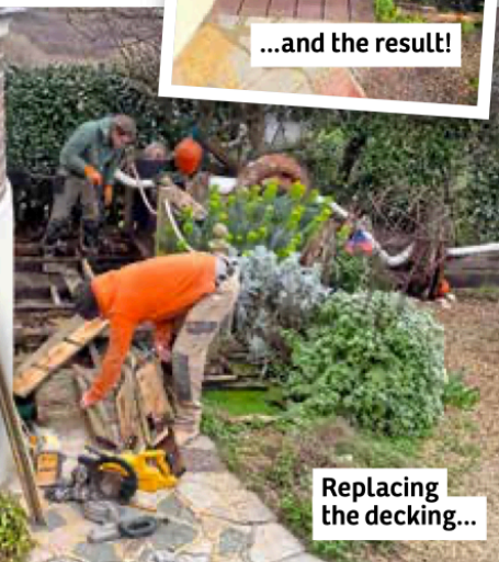
Replacing the decking...