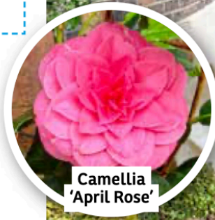
Camellia 'April Rose'

My Japanese 'Deshojo' maple bonsai has dramatic new red leaves after winter; I was praying it would survive on the patio at the back of the house. Visiting Wakehurst last year, I spotted a pretty camellia called 'April Rose' - that's my birth